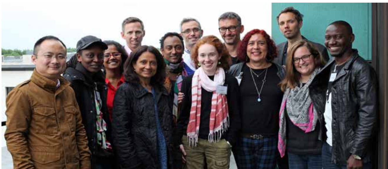
Salzburg Global Fellows of the second Global LGBT Forum together the Salzburg Global staff

needs to be follow-up, monitoring and evaluation, consistent communication and openness between all parties.